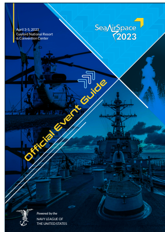
Sea Air Space 2023 Cover